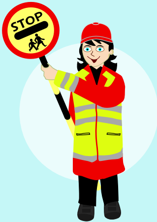
Figure C - Sign held up high Ready to cross pedestrians - vehicles must be prepared to stop